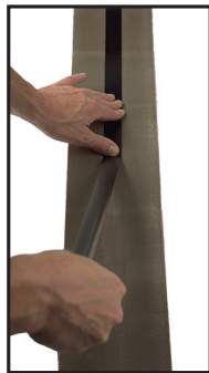
Apply taffeta in center