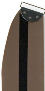
Trim Taffeta Strip to match radius of riveted skin tip

Adding the Nylon Taffeta Strips make it easier to pull apart your Voile Climbing Skins.